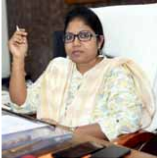
VIS News Service